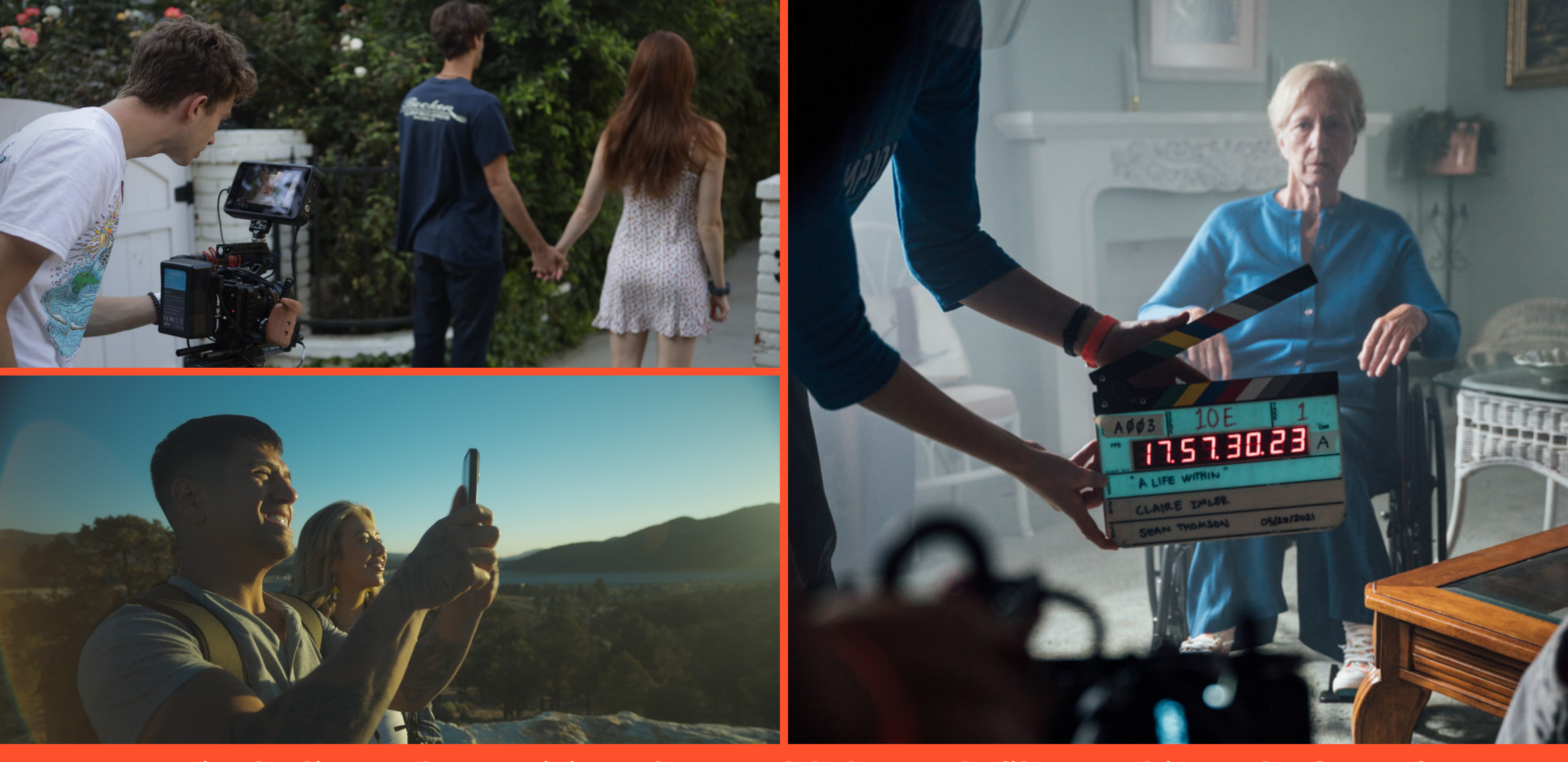
GIFF is dedicated to uniting the world through film and is a platform for filmmakers in all stages of their careers locally, nationally, and globally.